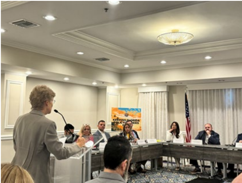
Florida Insurance Commissioner & South Florida State Representatives & Senators Meeting