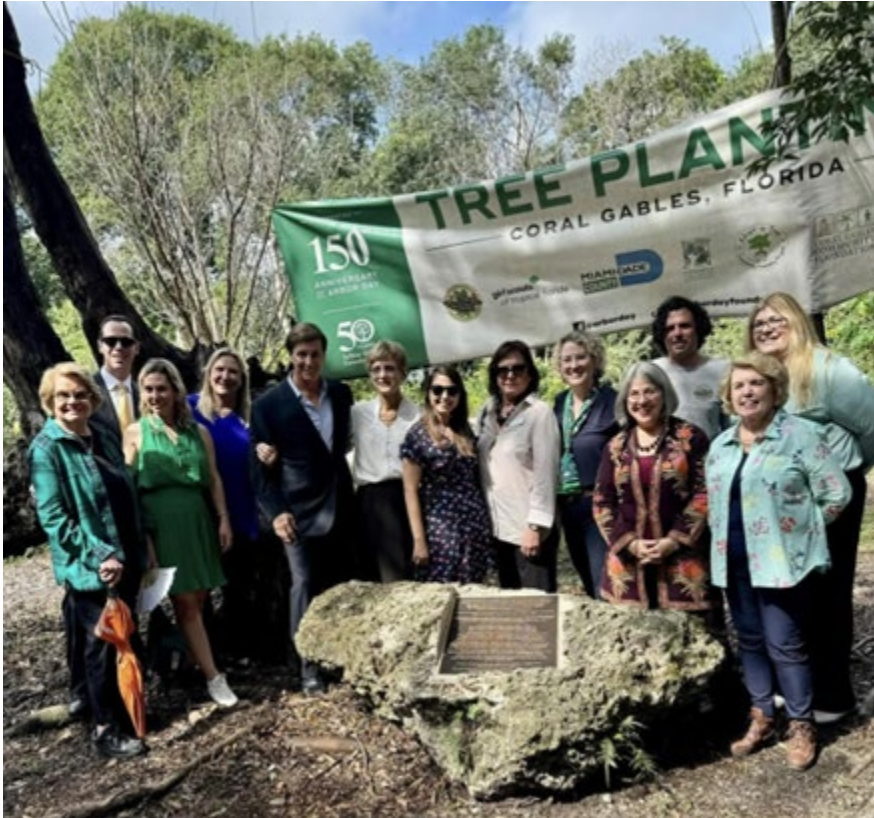
Camp Mahachee Tree Planting Dedication, March 2024

plant trees on both sides of the street, provide parks with shade trees and move healthy, non-invasive trees.