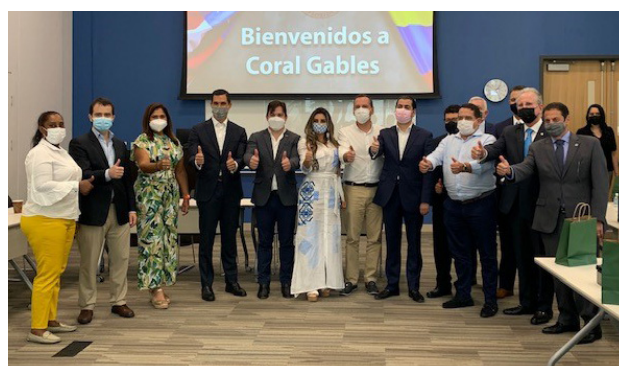
Colombian Delegation visits Coral Gables