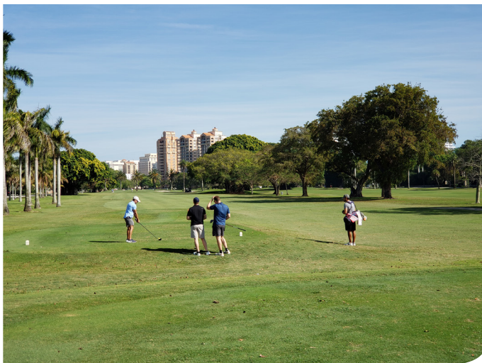
Granada Golf Course