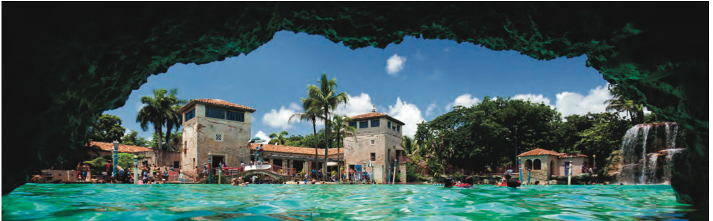
Venetian Pool